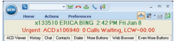
Compact mode provides a smaller footprint, yet access to all the companion applications plus the quick access toolbar for telephone controls